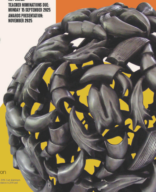
Image: Chris Semms, 'Spew! Part 1 in Series' 2019. Cast aluminium sculpture commissioned by The Gallery Foundation in 2019 and part of the gallery collection.