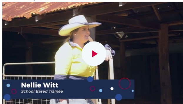
Educational Pathways Pilot Program TV - Episode 5